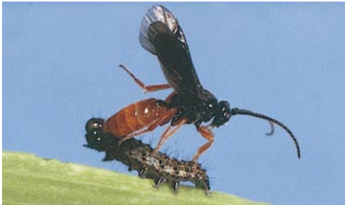
PAT GREANY USDA